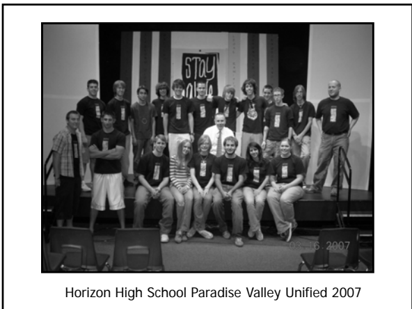
Horizon High School Paradise Valley Unified 2007