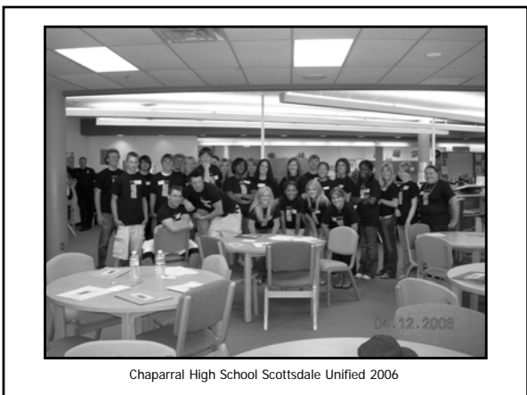
Chaparral High School Scottsdale Unified 2006