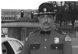
Getting Law Enforcement on Board