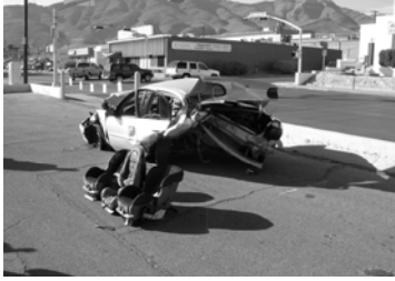
Two of the seats were received through a Safe Riders distribution program class.